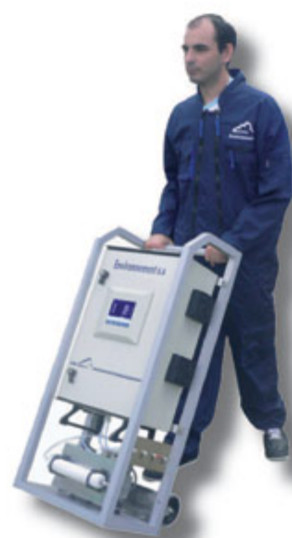
Transportable version (with chassis)