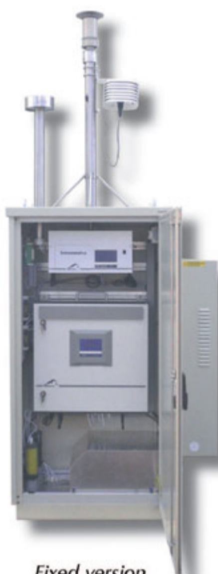
Fixed version (in street cabinet)